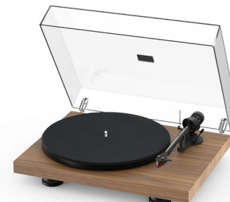
Satin Real-Wood Walnut Veneer