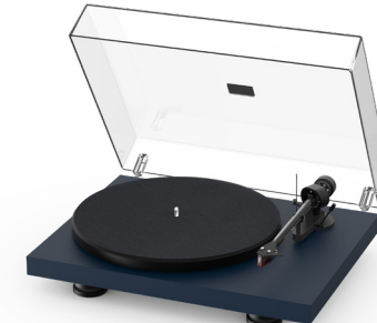
Satin Steel Blue