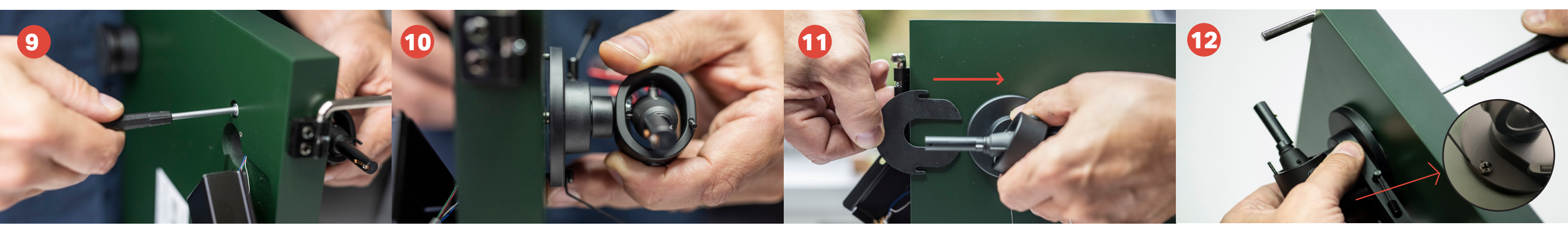
Loosen the upper nut by 3mm.