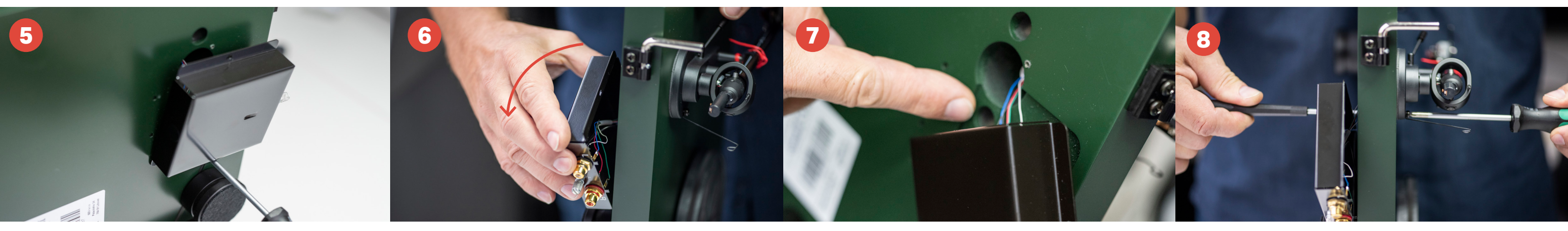
Loosen the lower screw just a little to be able to rotate the RCA box.

Bring the turntable in an upright position to have access to both the upper- and underside.